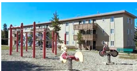
400 W 17th Street Leadville, CO #4