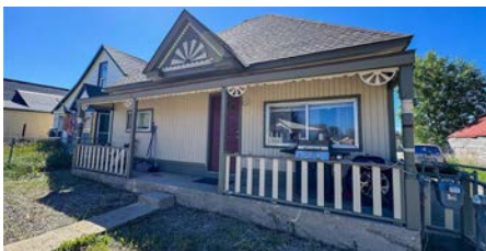
415 E 7th Street Leadville, CO #1