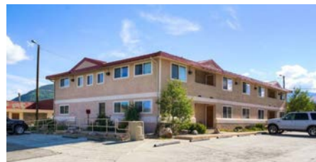
2020 N Poplar Street Leadville, CO #2