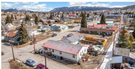
SUBJECT PROPERTY 629 Chestnut St., Leadville, CO