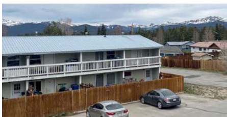
921 Mount Massive Leadville, CO #3