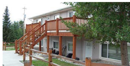
205 W 2nd Street Leadville, CO #5