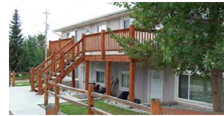
205 W 2nd Street Leadville, CO