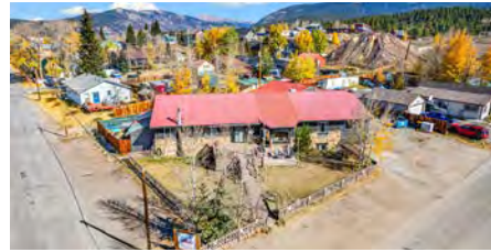
500 E 7th Street Leadville, CO