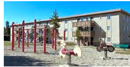
400 W 17th Street Leadville, CO