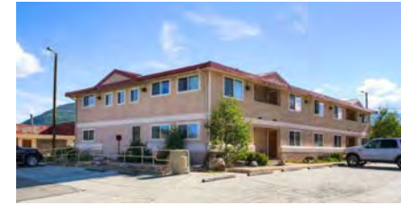
2020 N Poplar Street Leadville, CO