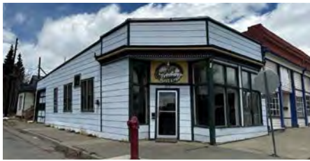
200 E 6th St. Leadville, CO