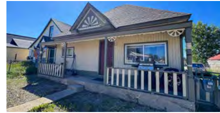
415 E 7th Street Leadville, CO