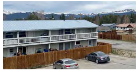
921 Mount Massive Leadville, CO