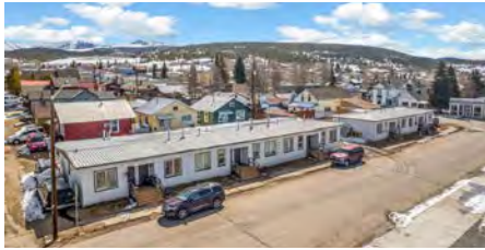
SUBJECT PROPERTY 500 Poplar St., Leadville, CO