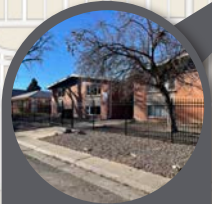
1415-1425 KINGSTON STREET